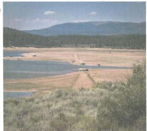
Boca & Loyalton Roadbed